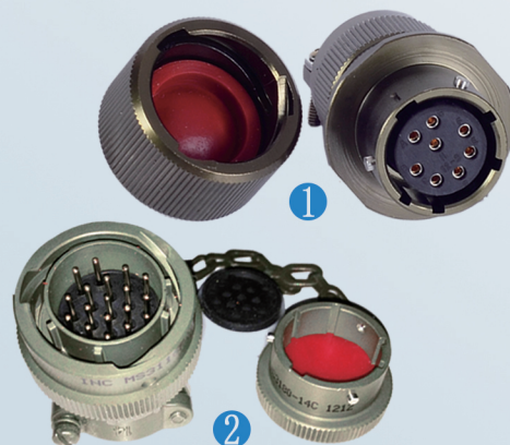
1. Magnetic Sensor Connector 8 Pins 2. Magnetic Sensor Connector 18 Pins