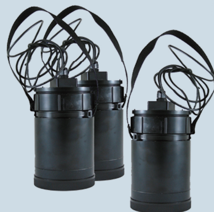
Porous Pot Electrodes