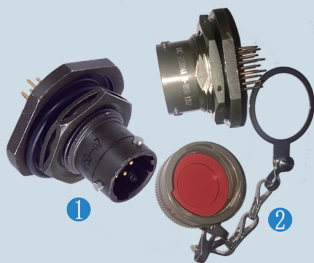
1. Battery Socket 4 Pins 2. Magnetic Sensor Socket 18 Pins