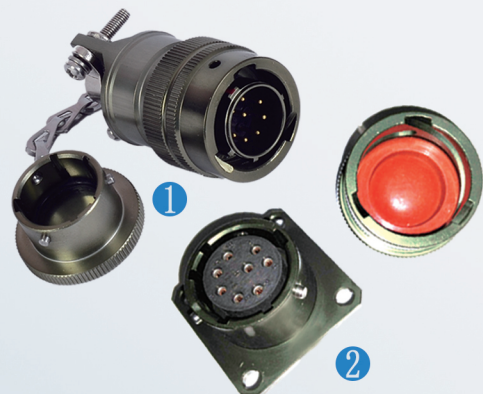
1. Magnetic Sensor Connector 8 Pins 2. Magnetic Sensor Socket 8 Pins