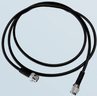
GPS Receiving Antenna Cable