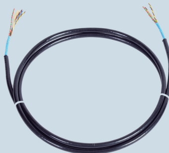
WMT Sensor Cable