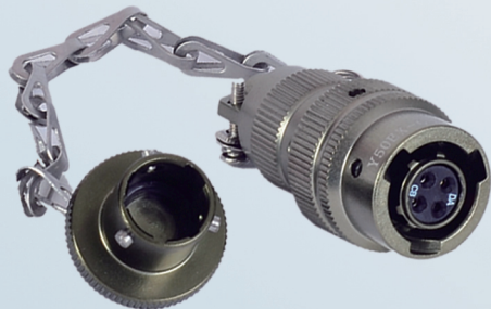
Battery Connector 4 Pins