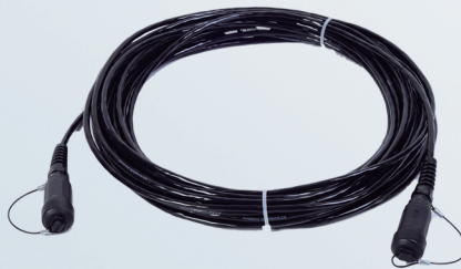
Coil Sensor Cable