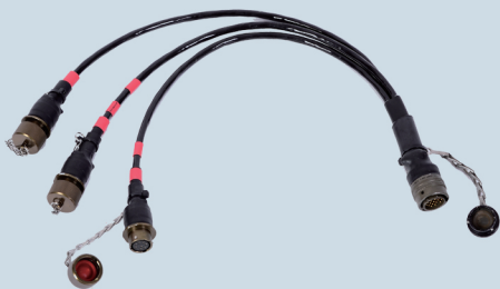
Sensor Cable Adapter