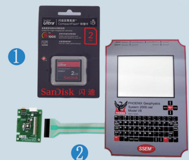
1. CF Card 2. V8 Keyboard